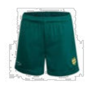
Squadkit Hydrocool Lite Green Crested PE Shorts