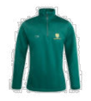
Squadkit Thermotex Midlayer Green Crested Top*