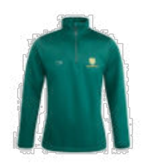
Squadkit Thermotex Midlayer Green Crested Top*