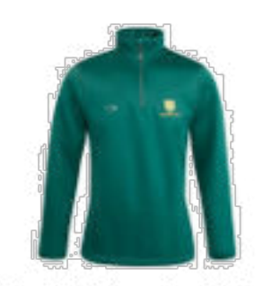
Squadkit Thermotex Midlayer Green Crested Top*