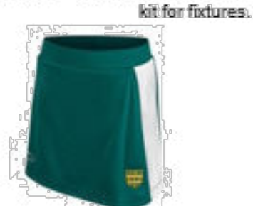
Squadkit Hydrocool Lite Green and White Skort (Girls)

To be worn for all PE. lessons, netball and summer sports