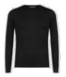
Black base layer top

To be worn underneath during cold weather