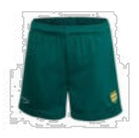
Squadkit Hydrocool Lite Green Crested PE Shorts